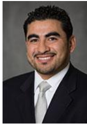
Rep. Armando Walle