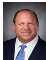
Rep. Mano DeAyala