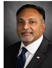
Rep. Suleman Lalani*