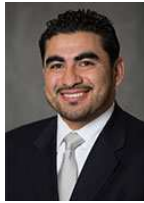
Rep. Armando Walle