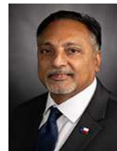
Rep. Suleman Lalani*