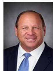
Rep. Mano DeAyala