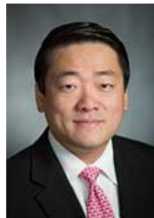
Rep. Gene Wu