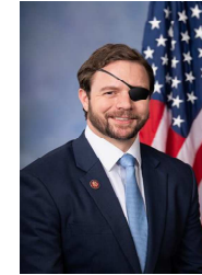
Congressman Dan Crenshaw CD 2