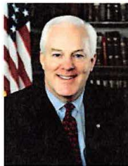
Senator John Cornyn