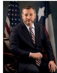
Senator Ted Cruz