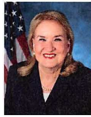
Congresswoman Sylvia Garcia CD 29