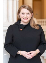
Congresswoman Lizzie Fletcher CD 7