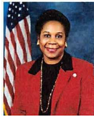
Congresswoman Sheila Jackson Lee CD 18