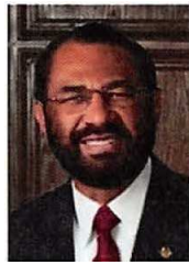
Congressman Al Green CD 9